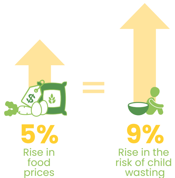
Figure 2. Food price inflation dramatically impacts wasting: a five percent rise in food inflation equals a nine percentage increase in risk of moderate/severe wasting

The impact was much larger in particular sub-population groups. The risk of wasting from food inflation is about 1.5 times higher for children in households that are asset-poor compared to children in non-poor households 7 . In rural areas, children in households that do not own land and cannot grow their own food